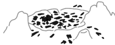
Black, crumbly wood and ash

How do you think these shapes ended up deep in a watery cave?