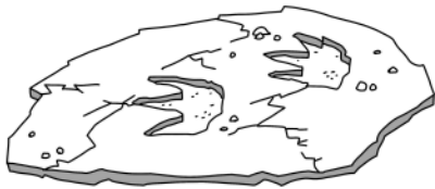
Shapes in the ground

How do you think these shapes were made?