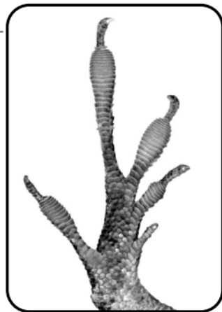
Scales on the bottom of a green anole's foot

So the scientists discovered that the green anole lizards and the brown anole lizards can share the same island. The green lizards live high in the trees and the brown lizards live close to the ground. And both kinds of lizards find bugs to eat wherever they are.