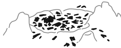
Black, crumbly wood and ash

How do you think these shapes ended up deep in a watery cave?