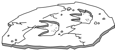
Shapes in the ground

How do you think these shapes were made?